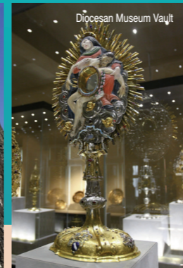
Diocesan Museum Vault