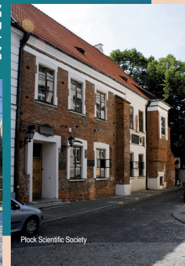
Płock Scientific Society