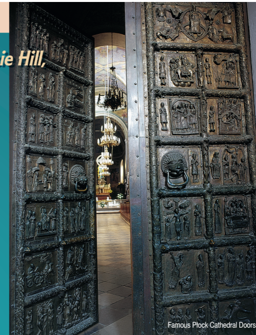
Famous Płock Cathedral Doors