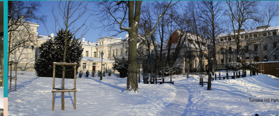
Tumskie Hill Park