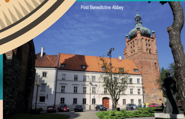
Post Benedictine Abbey

in the former Benedictine abbey, the Diocesan Museum is located. Among a large variety of exhibits, including for example kontusz sashes (kontusz being a traditional Polish robe-like male garment) and liturgical vestments, certain manuscripts and documents represent the greatest value. These are among others The Bible of Płock from the 12th century and the town's foundation act from the year 1237. Museum's treasury is the greatest pride of all museologists from Płock. You can admire there shiny gold monstrances, calyxes and reliquaries encrusted with precious stones. Moreover, the collection includes a Roman calyx of Konrad Mazowiecki, Duke of Mazovia and a herm – reliquary for the head of Saint Sigmund, a gift from Kazimierz Wielki, the king of Poland.