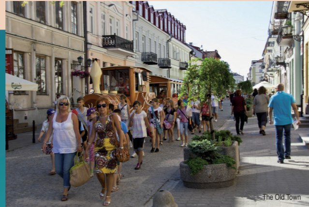
The Old Town