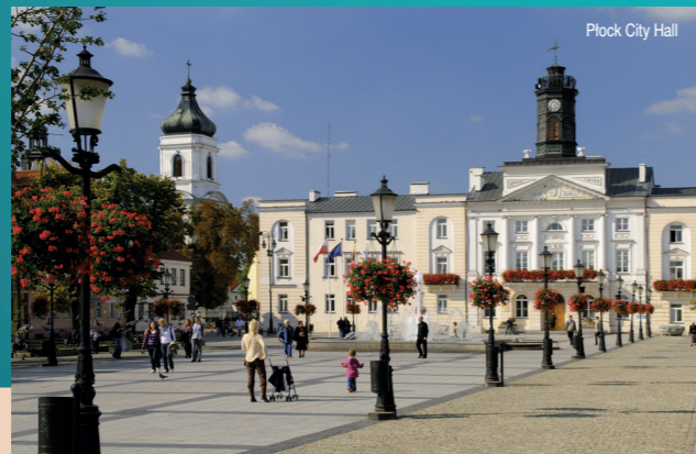
Płock City Hall